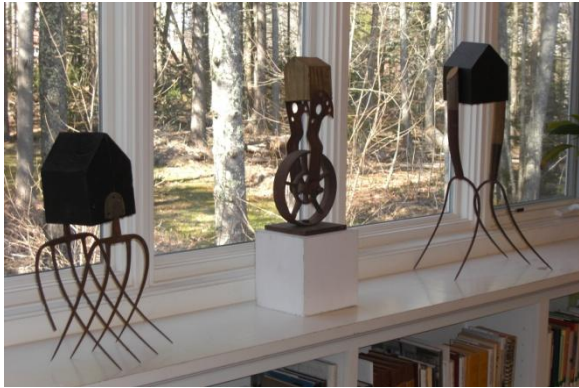
Sculpture by Axel Stohlberg in our April art exhibit