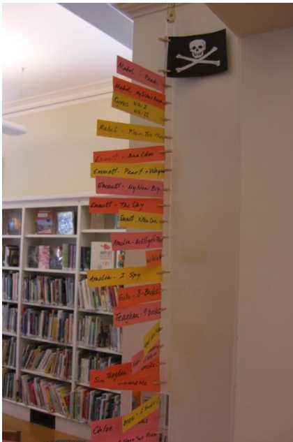
Summer Reading rigging

Kids, in July and August the Pirates will return to the library for summer reading, but this year they will be joined by the Ship's Cats. There will be one line of rigging for the Pirates and one for the Ship's Cats. Every time you read one or more books, you can run your pennant up for either the cats or the pirates, and collect a chocolate-filled gold doubloon for each book!