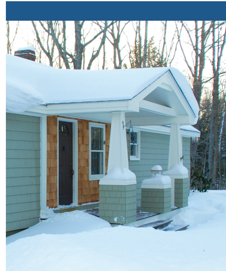
Typical Annual Home Heating Costs